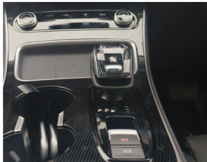
Crystal gear lever