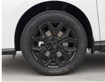
18 Inch Sport Wheels