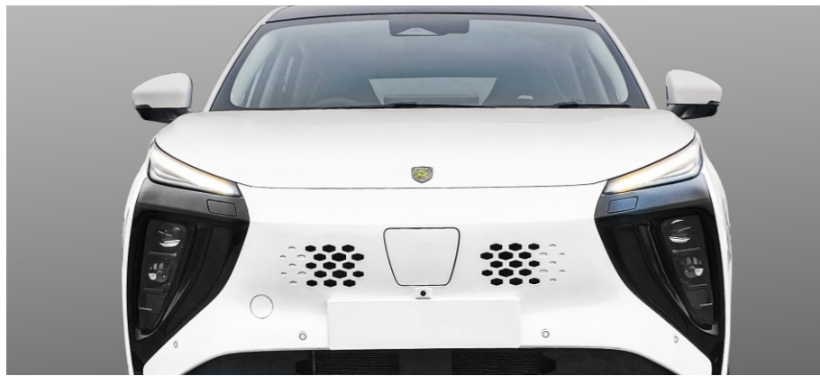
Frameless Mesh-Style Grille