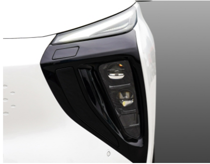
Thunder Axe LED Headlights