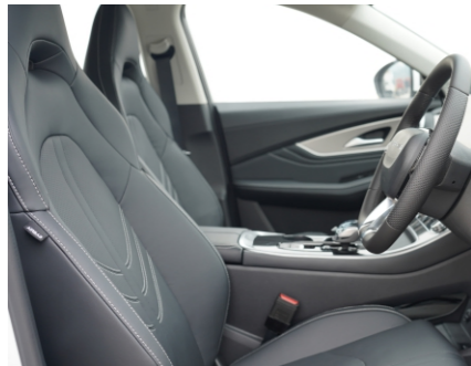
Intelligent Thermostatic Seat